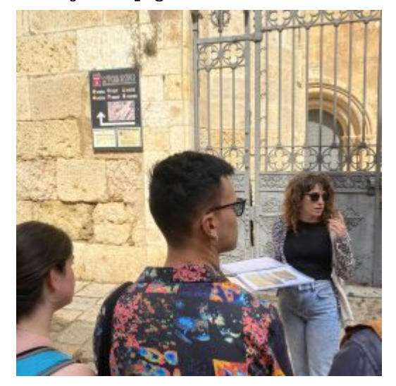
Passejada epigràfica 2023 (3)