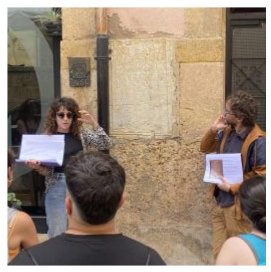
Passejada epigràfica 2023 (4)

The awarded teams in the 12th edition of the Odissea Contest were: