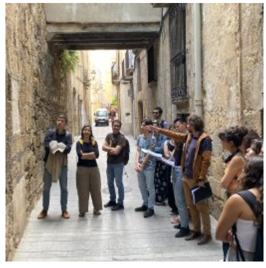
Passejada epigràfica 2023 (2)