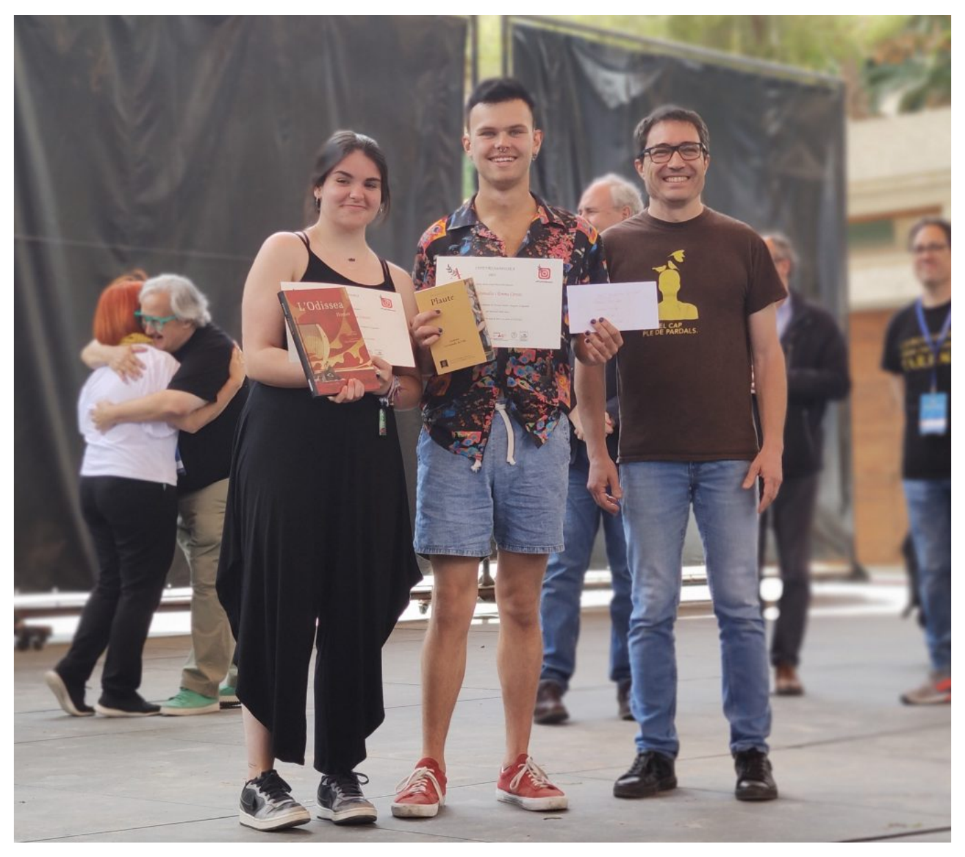
Xavier Tresserra also presented the Odysseus 2023 Photo Prize.