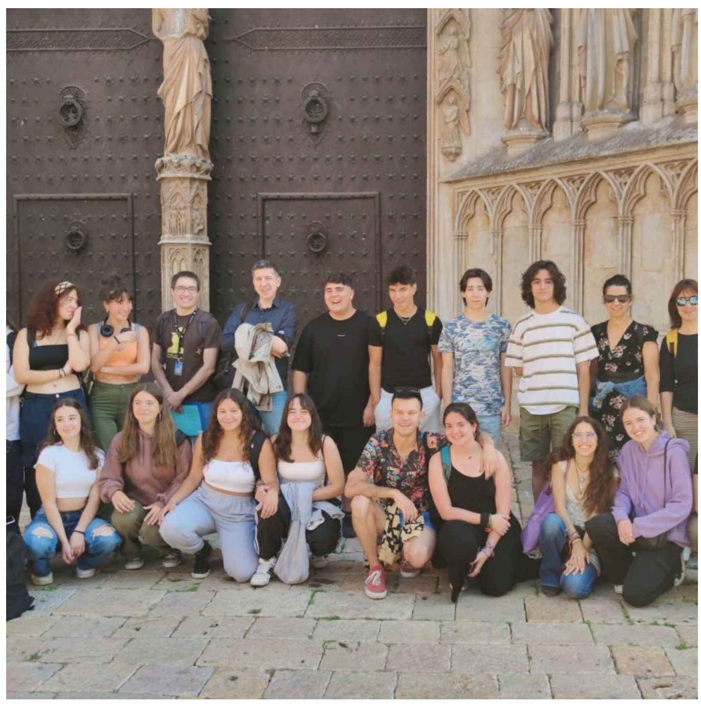
Passejada epigràfica 2023 (1)