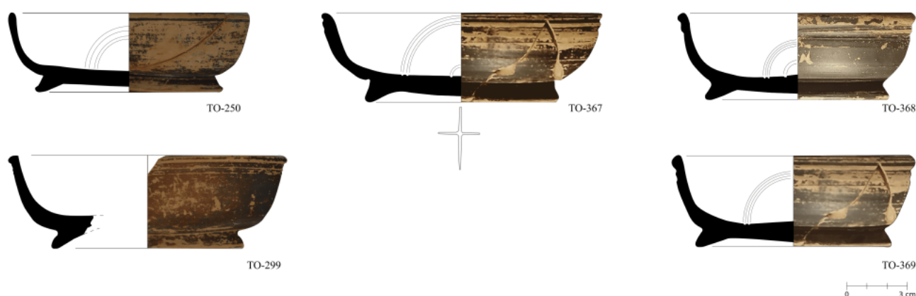
Figure 41. Bowls of Lamb. 1 / F2320, 2361 of late Campanian B Calena ceramic.

For more information, please contact ICAC Publications through our website or follow us on social media (@ICAC_cat / @icac_cat) for updates on our publications.