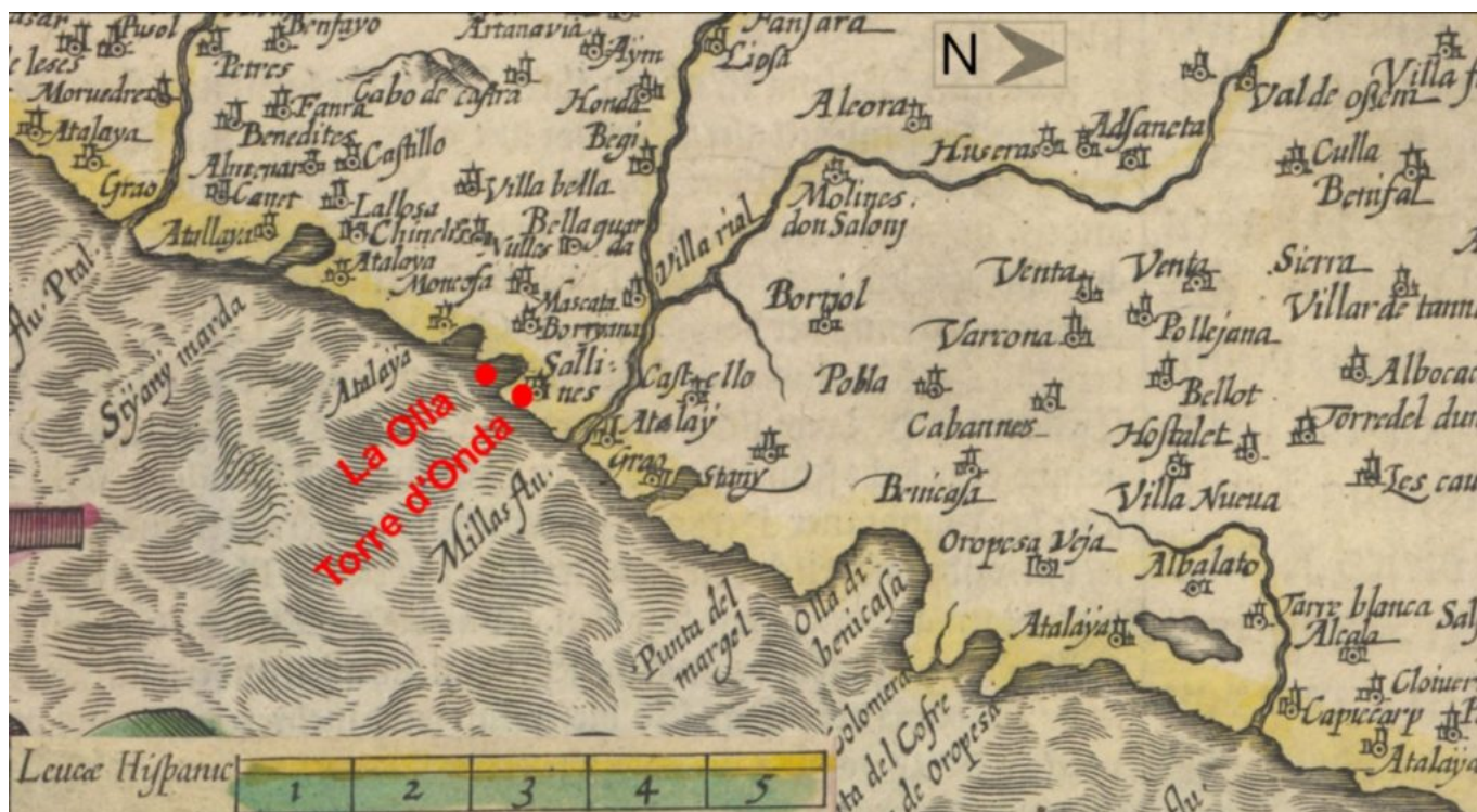
Figure 3. Detail from the Atlas Novus by W. Blaeu (1640). In red, is the location of Torre d'Onda, north of the inlet known as "la Olla".