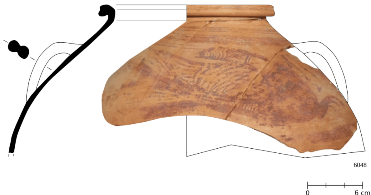
Figure 18. 6048: ovoid-bodied jar with twin vertical handles, decorated with a figure of a bird with spread wings and turned head (@ the authors).