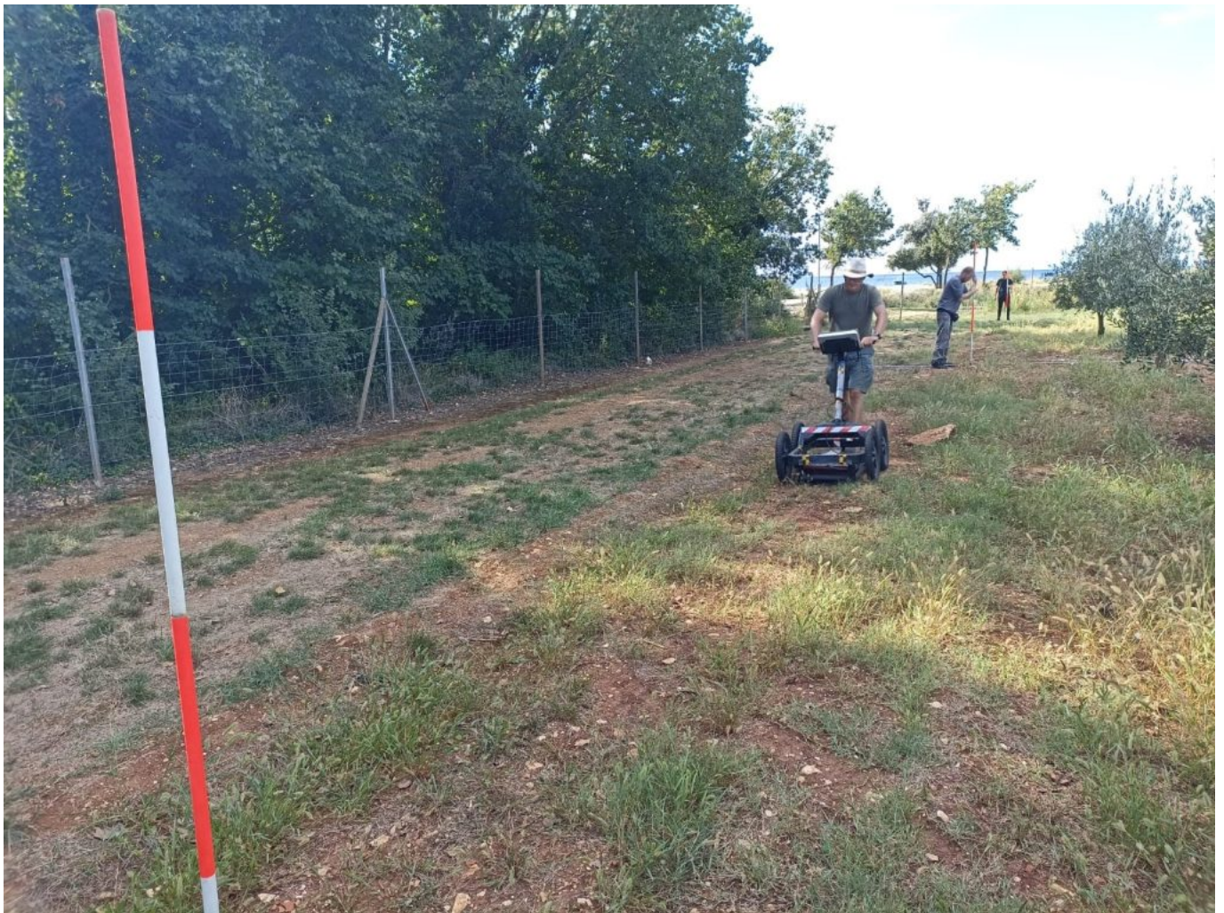
Survey undertaken in September 2023.

An exploratory ground penetrating radar (GPR) survey was conducted in September 2023 by Prof. Fabian Welc (Cardinal Stefan Wyszyński University, Warsaw) and initial results have been very promising, showing the presence of large-scale structures across much of the area beyond what has been previously excavated. Additional GPR and magnetometry surveys are planned for 2024.