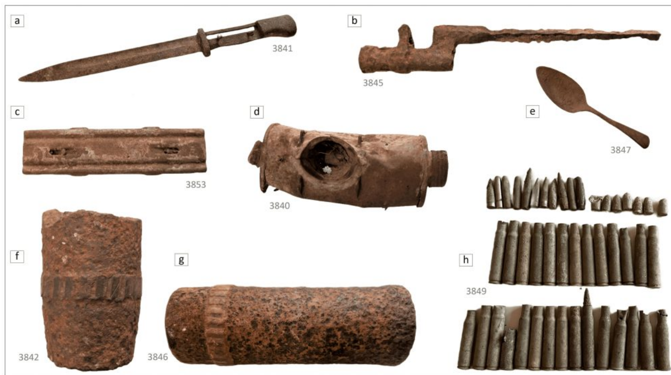
Figure 04. Collection deposited at the Museum Archives of Sant Andreu de Llavaneres, originating from an illicit extraction at Balís carried out in the early 2000s.

The research has been published in the International Journal of the Civil War, Ebre 38 , from the University of Barcelona. It promotes historical, archaeological, and didactic dissemination studies on the heritage of the Spanish Civil War.