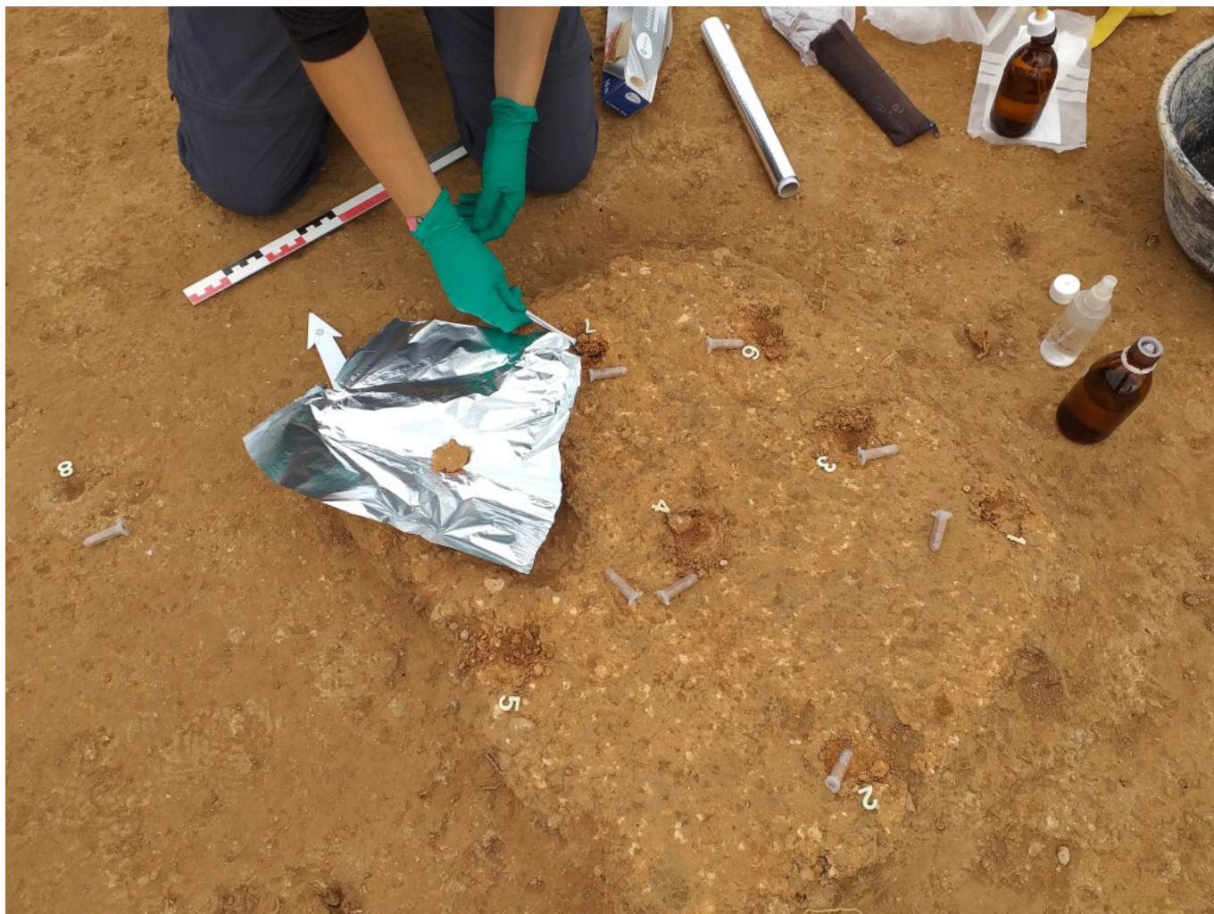
Collection of samples for the interdisciplinary analysis on a fireplace from the Iberian archaeological site in Castellet de Banyoles (Tivissa, Tarragona).

In the Memoria 2020 report, you can check all data concerning the ICAC activity in 2020, and in more detail the scientific output of each ICAC researcher.