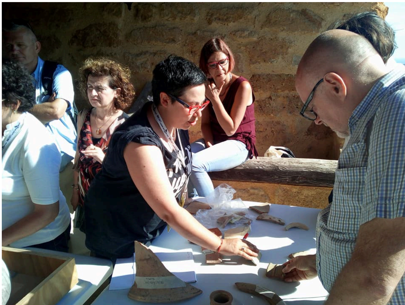
Activity during the LRCW 6th edition (Agrigento, Italy)