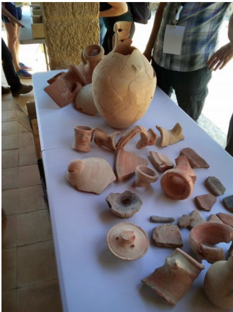
LRCW6 (Agrigento, Italia)

Every session will be introduced by a 30-minutes-long paper presented by a guest speaker, followed by oral presentations. There will be a poster(s) session(s) and a workshop displaying pottery from late Roman contexts. The conference is planned in five sessions following these themes: